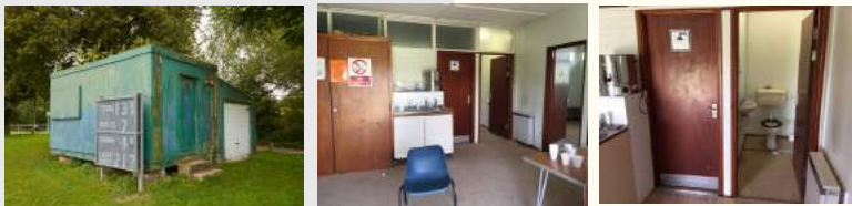
Existing pavilion and scoring huts

The Pavilion Project is a community group and registered charity working with local architects, AR Design Studio, to replace the dilapidated cricket pavilion and scoring huts at North Walls Recreation Ground in Winchester.