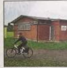
The current pavilion