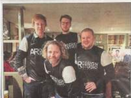
First fundraiser proves successful

THE first fundraiser for the project has been a success, with over £1,000 raised for the new pavilion. The fundraising event, held at the North Walls Recreation Ground on January 19, was a success for the project. The event included the sale of raffle tickets, a quiz, and a raffle. The project is a community-led effort with the support of local sports and community groups, including High Road, so it's great news the Town Council has given us the green light to start fundraising. AR Design's concept is really well done and sensitively conceived. It complements its surroundings, solves both the problem, while maintaining, accessible and could be used as a water community site too. We really hope people will be excited as we see and get behind the project."