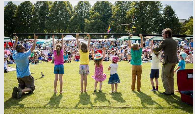
Children joining in with a Winchester Hat Fair performance

The Round Table hosts the annual firework display at this location and many other events take place here throughout the rest of the year; the Chilli Festival, "Winchestival" (now in its third year), outdoor cinema and, new in 2018, Winchester's famous Hat Fair.