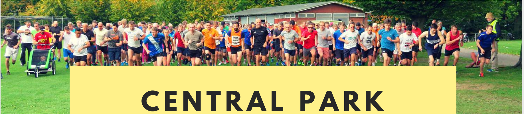
Park Runners run from the pavilion every Saturday