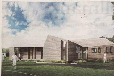
Proposed cricket pavilion at North Walls Recreation Ground. Architect: AR Design Studio