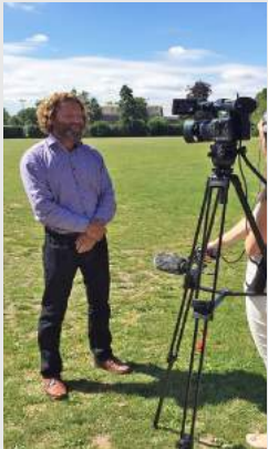
Pavilion architect talking to local TV news

The Pavilion Project offers many sponsorship opportunities for both business and grant-giving bodies.